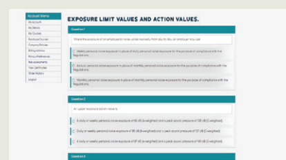
Final Exam – Certificates Provided.